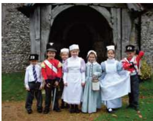
HCS Junior School Year 2 pupils visiting East Wellow church to find out about Florence Nightingale