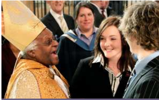
Archbishop Desmond Tutu shares a joke with HCS Students at the 125 Jubilee Celebrations for UCST at Canterbury Cathedral