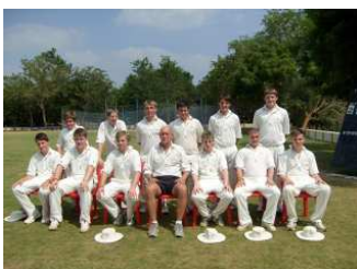
Pupils and staff on the India Cricket tour during October Half Term.

We have enjoyed pantomime, the autumn musical evening, trips to the battlefields in France, a super sports trip to Malta, geography field trips, amongst a host of other activities too long to account in detail. All of these things illustrate what a dynamic school HCS is, based upon two excellent former traditions that we would like to